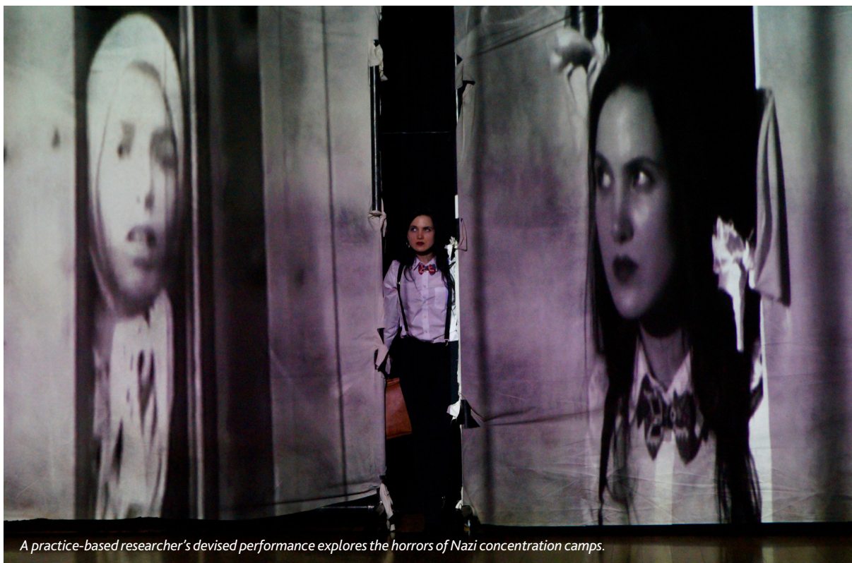
A practice-based researcher's devised performance explores the horrors of Nazi concentration camps.