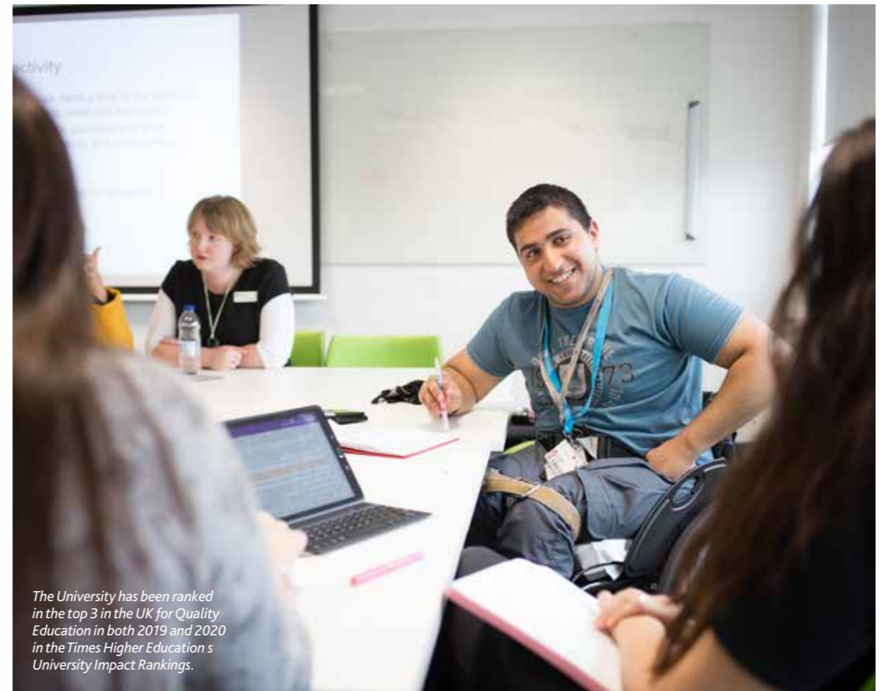
The University has been ranked in the top 3 in the UK for Quality Education in both 2019 and 2020 in the Times Higher Education's University Impact Rankings.

A key feature of a University of Worcester education is the interweaving of expert knowledge and practical applied learning based on a golden triangle of well-motivated students, inspirational educators and expert professional mentors. The University's reputation for excellence and quality in education, our capacity for continuous enhancement and innovation, means we are committed to inspiring our students for life, through creating possibilities, developing potential and building partnerships.