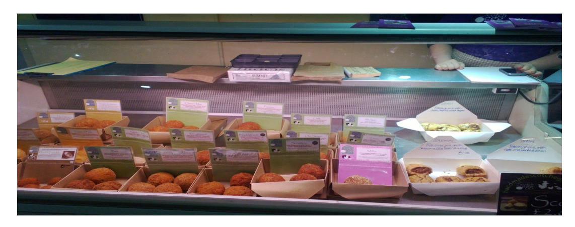
The huge range of delicious scotch eggs, yum!