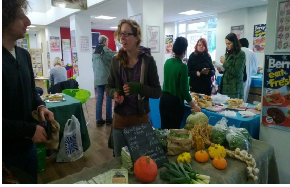
The Fold with a bountiful load of fresh vegetables produced on their local care farm

We kindly had a donation of two massive boxes of fresh produce from Worcester Produce that was entered as a competition, the lucky winner would be having a very healthy week of food!