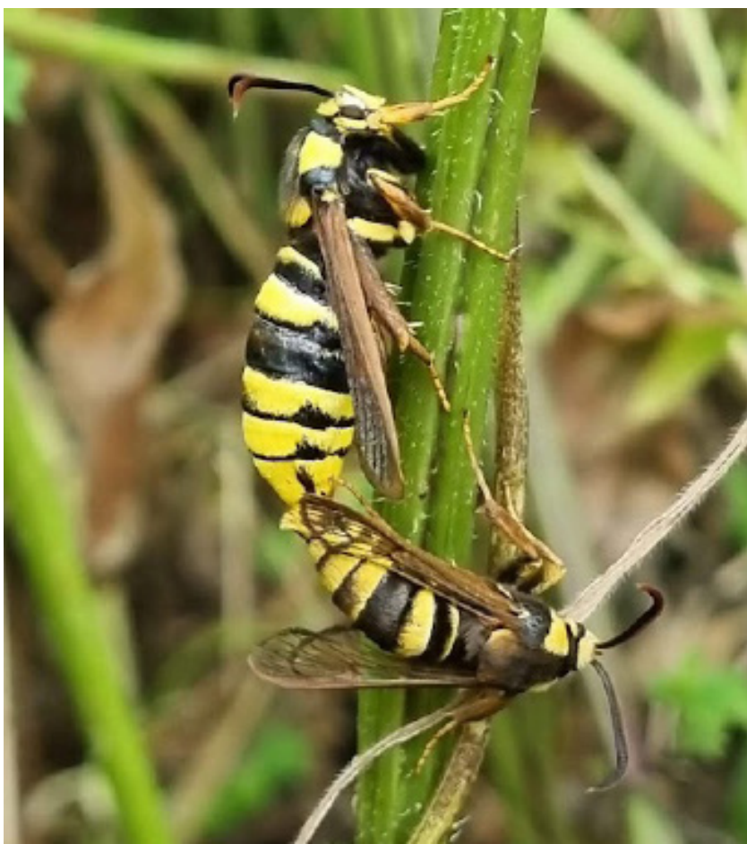
A Lunar hornet moth pair ( Sesia bembeciformis ) recorded on St John's Campus

We intend to create more training opportunities for students, staff and members of the public relating to biodiversity monitoring as part of this project. These records will be added to those already created using other recording schemes, e.g. iRecord, eBird and records from professional surveys undertaken during development works. We will particularly prioritise recording from Lakeside, City and Severn Campuses, as these are under-recorded currently. The University will also continue undertaking tree surveys and hedgerow surveys to assess their composition, quality and 'connectivity' and to inform management practices. We will disseminate information on biodiversity records on an annual basis, but more regularly where possible.