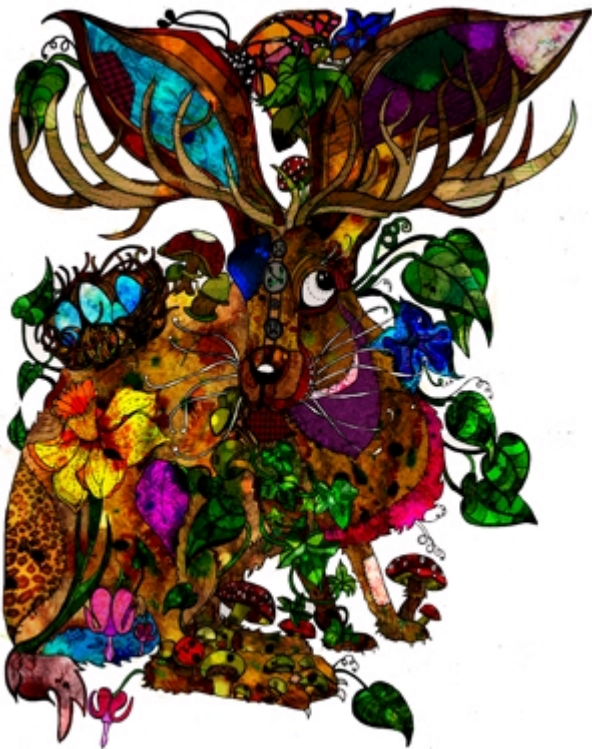
Illustration BA (Hons)

The Illustration course at Worcester covers the complete range of genres: illustration for children's books, political articles, magazine, the graphic novel, television and advertising.